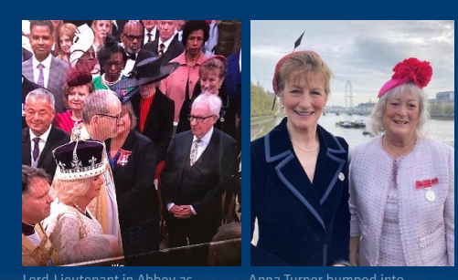
ewly crowned King and Quee

I am so honoured to be Lord-Lieutenant of Shropshire and represent the County. I hope you enjoy this special newsletter that is in a pictorial format that captures the joyous events that took place throughout Shropshire to celebrate this historic occasion. For more images of events please do take a look at our website. www.lordlieutenantofshropshire.org.uk