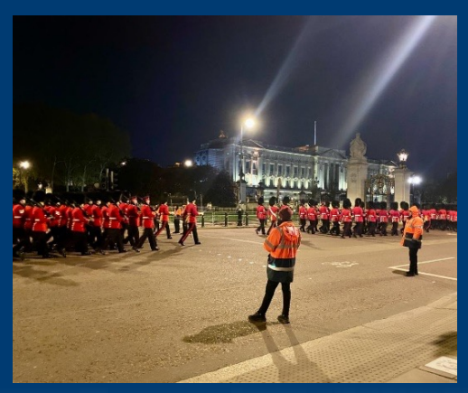
Coronation rehearsal in London on 2nd May 2023