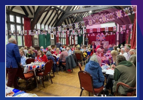
Coronation party held at Wistanstow village hall.