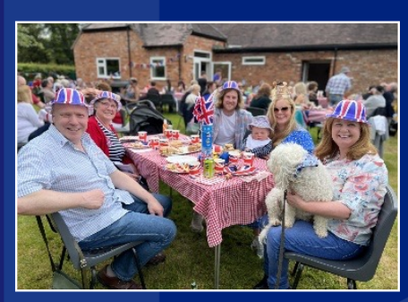
Coronation party held at Uffington village hall